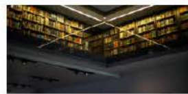
SCIENCE & EDUCATION FOR SOCIETY