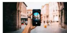
TOURISM & CULTURAL HERITAGE