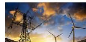
ENERGY & CLIMATE CHANGE