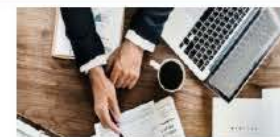
INNOVATION & INVESTMENT