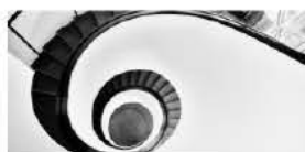
DESIGN & CREATIVITY